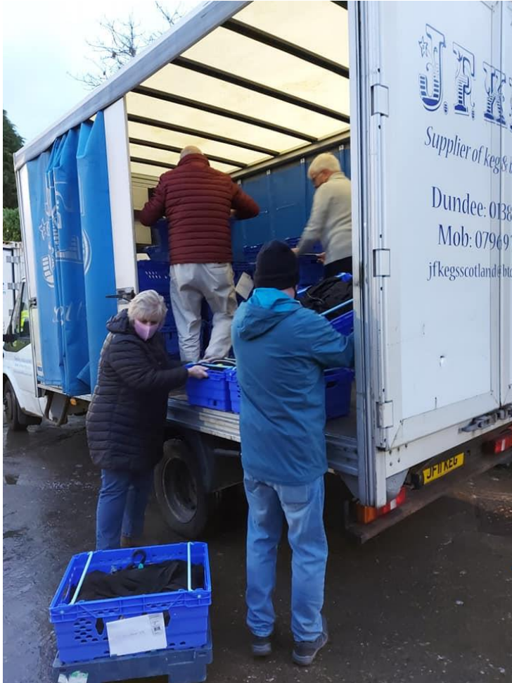
Volunteers receive clothing from Tesco and pack it onto the van for delivery to MSIP.

Michelin Scotland Innovation Park identified space within their complex where clothes could be stored and all COVID guidelines met. A bespoke referral form was sent to all schools and returned within the deadline of the end of November. The number of children identified had now reached 2926. The orders were collated within three weeks and the first orders went into suppliers very quickly thereafter.