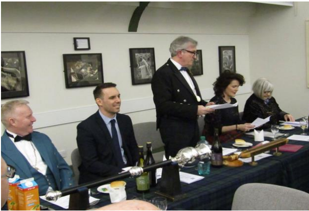
Top Table guests (left to right)