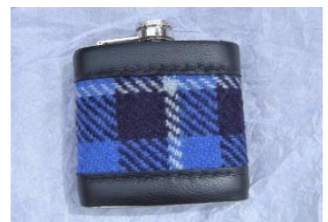
Weaver Craft hip flasks are available to purchase