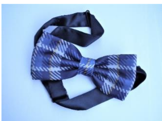
Weaver Craft bowties are available to purchase

Sheena performed on two sessions during the Dinner encouraging those attending to join in with some of the 'weel kent' songs which went down well with everyone on the night.